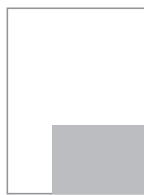
Quarter Tabloid Horizontal 7 x 5"