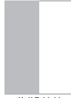
Half Tabloid Vertical Trim Size: 5.25 x 14"