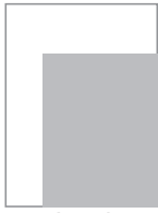
Journal Trim Size: 7.5 x 10.25"