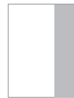
1/3 Tabloid Vertical Trim Size: 3.5" x 14"