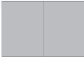
Tabloid Spread Trim Size: 21 x 14"